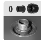
Universal w/ cable entry nut plug

Universal grommet (P/G), Hole at the back