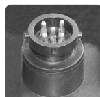
5 pins plug